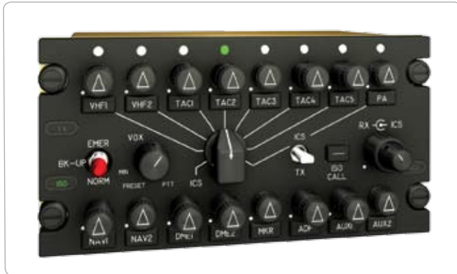
ACP53 Audio Control Panel