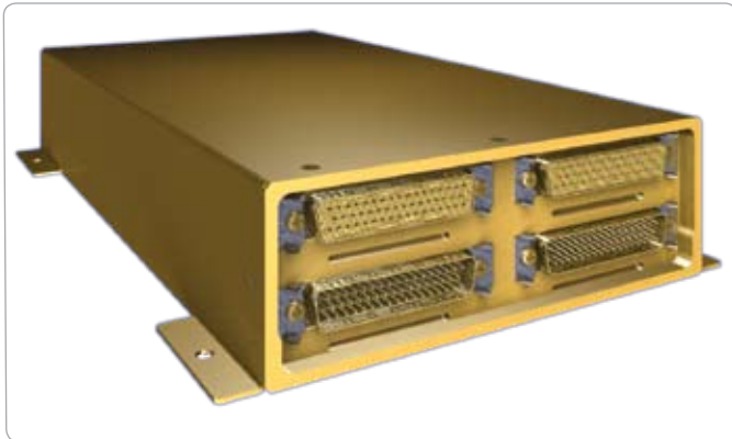
AMU50 Audio Management Unit