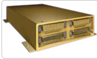
AMU50 Audio Management Unit