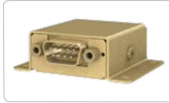
RM01 Remote Memory