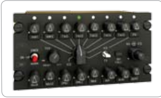
ACP53 Audio Control Panel

The most important thing we build is trust