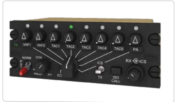
ACP51 Audio Control Panel