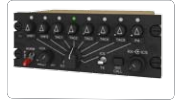
ACP51 Audio Control Panel