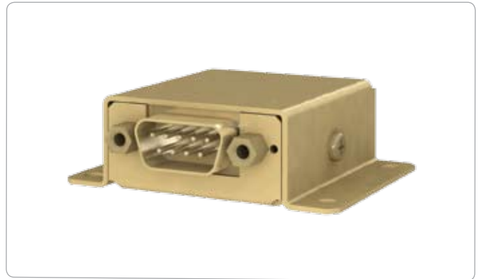
RM01 Remote Memory